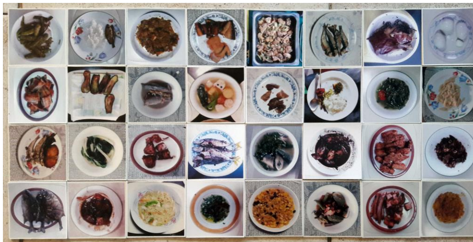
Figure 1. Detail of Daily Meal. Each food is printed on 3"x3" decal paper on precut vinyl tile

The series of photographs of Daily Meal is evocative in the combination with other photographs. Individually, each of these photographs is not particularly expressive and cannot be narrative, although the picture of each food has its own story to tell. However, as a whole, they gain their ability to communicate. As Berger (2016) points out, "no words redeem the ambiguity of the images...the reader is free to make his way through these images" (284). The researcher (and artist at this time) fills in the gaps between each photograph, allowing him to read across the appearance and see another reality that is hidden by the passing of time. As he becomes more involved in viewing the photographs, there is a heightened aesthetic response. The combined pictures of foods arranged alongside of each other is reminiscent of his childhood days when they cover their dining table with plastic adorned with checkered designs.