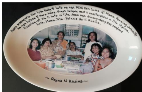
Figure 3. Detail of Plated Memories. The narratives in the plate tell about the persons in the photograph

The photograph (C) serves to introduce the personas. Together, they form the social context of an immediate family. They are the people in the family that have contributed to the researcher’s growth. They are the people that have helped preserve the ritual, habits, and culture of the Ilocano which define a particular way