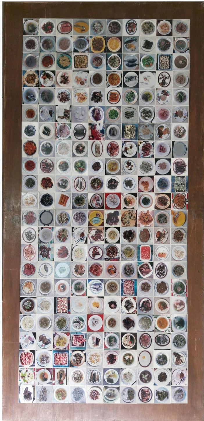
Daily Meals - 220 pieces of 3" x 3" decal prints on precut vinyl tiles