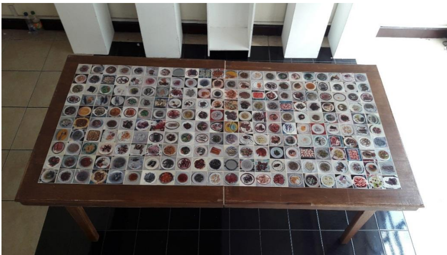
Daily Meals on table