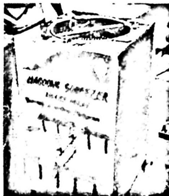
Fig. 7. A third design to improve the bottling process was the provision of bigger perforations to 3/4 of the cylinder; as well as the installation of 6 faucets, tripling the speed of the former design to bottle the fish sauce.