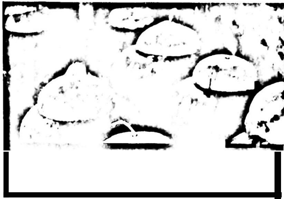
Fig. 3. Bagoong fermenting in burnay jars. Photo taken in Ilocos Norte, Philippines