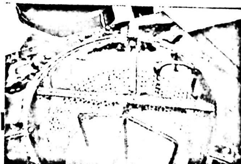
Fig. 6. The cylindrical bucket, with a paddle, squeezing 20 liters of fermented bagoong.

The casing (Fig. 2) carries the cylinder (Fig. 5) with perforations and the paddle (Fig. 6) which stimulates the squeezing activity. The cylinder will contain the fermented fish to be squeezed. The ¼ hp capacity of the motor was based from the Santa cooperator with very fluid fish sauce formulation. The cooperator is only using anchovies ( monamon ) as the basic fish substrate.